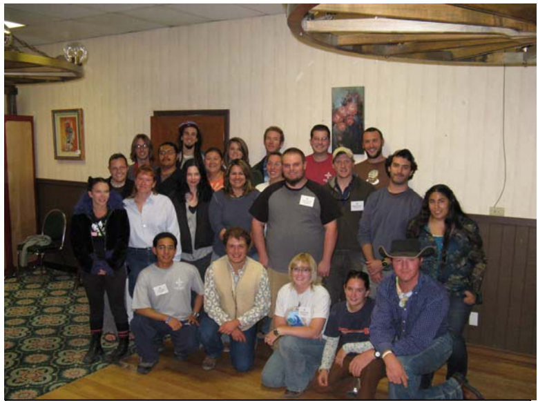
Students attending the Silver City Fall Field Conference.