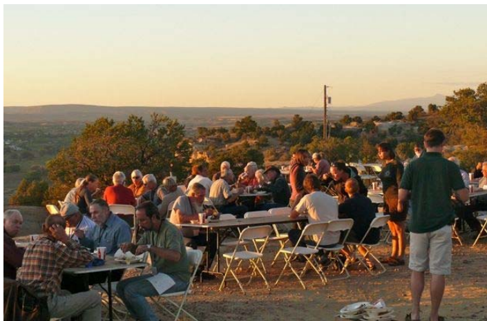
BBQ at Bruce Black's home near Farmington.

Total attendance at the conference numbered 138, including the 22 students listed below whose expenses were covered by NMGS FFC scholarships.