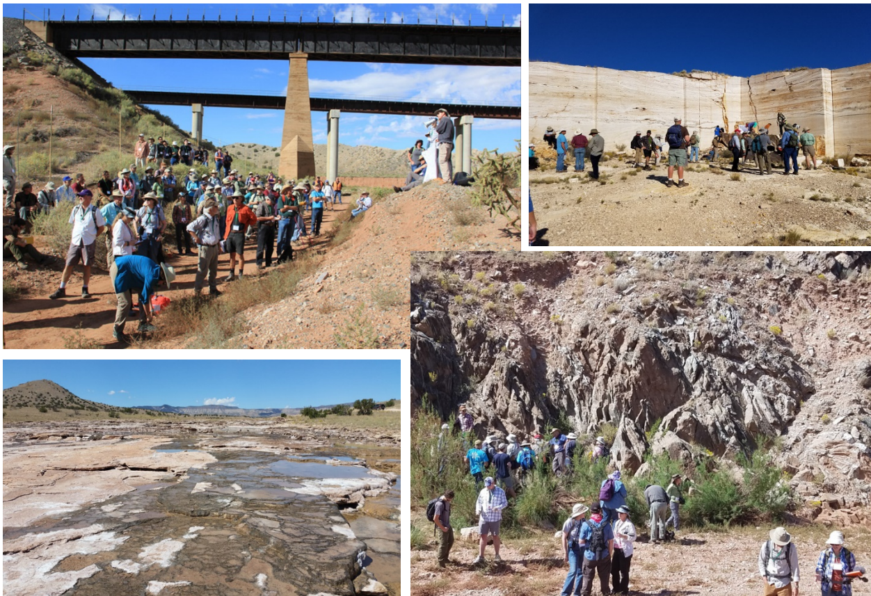
Photographs from the 2016 Annual Fall Field Conference in the Belen, New Mexico area.