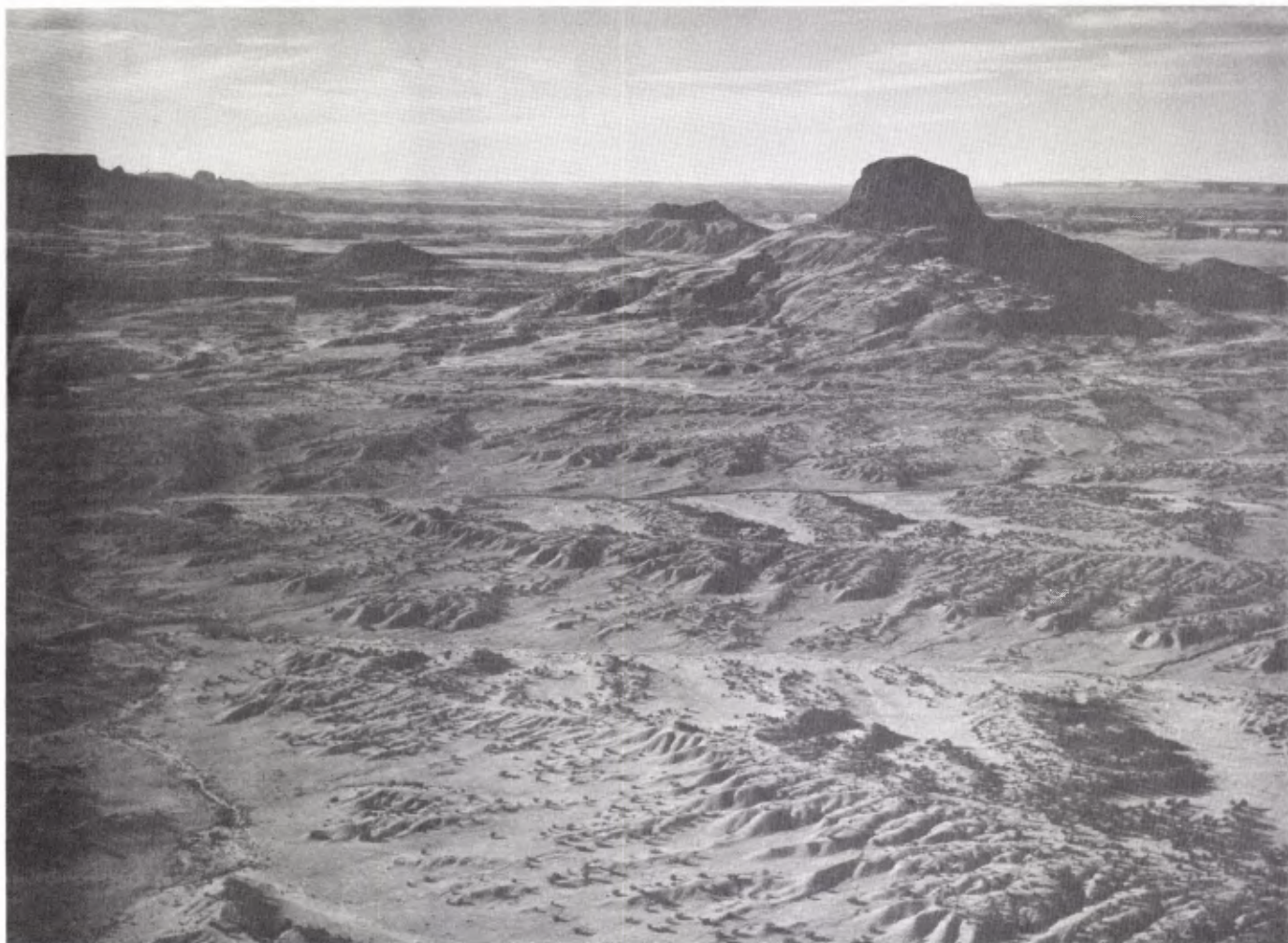
Air view of Cabezon Peak and other volcanic necks in the valley of the Rio Puerco.