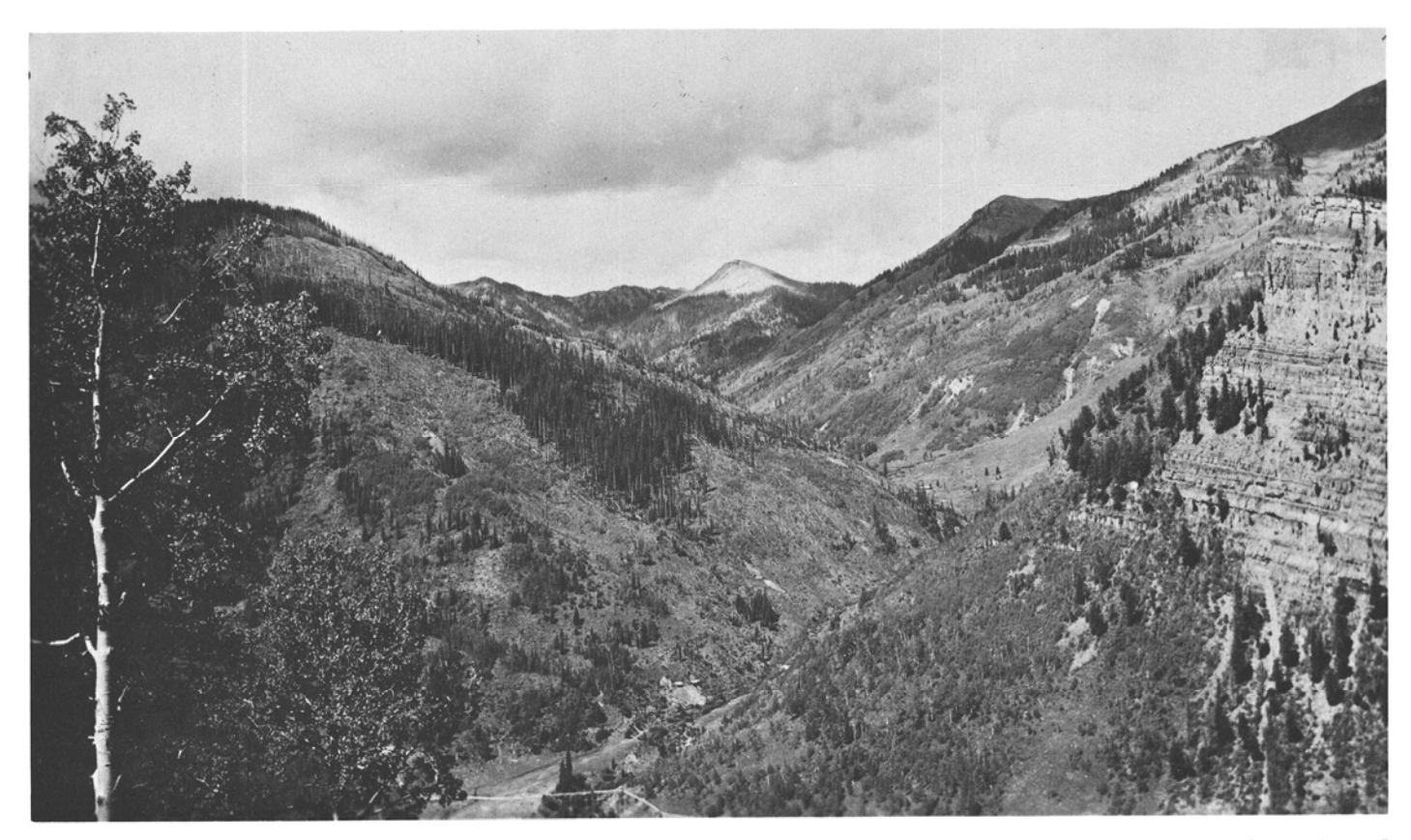
Horse Gulch from C.H.C. Hill, Rico District, Dolores County, Colorado (1900). Published as plate 38 in U.S. Geological Survey Annual Report 22, pt. 2, 1901.