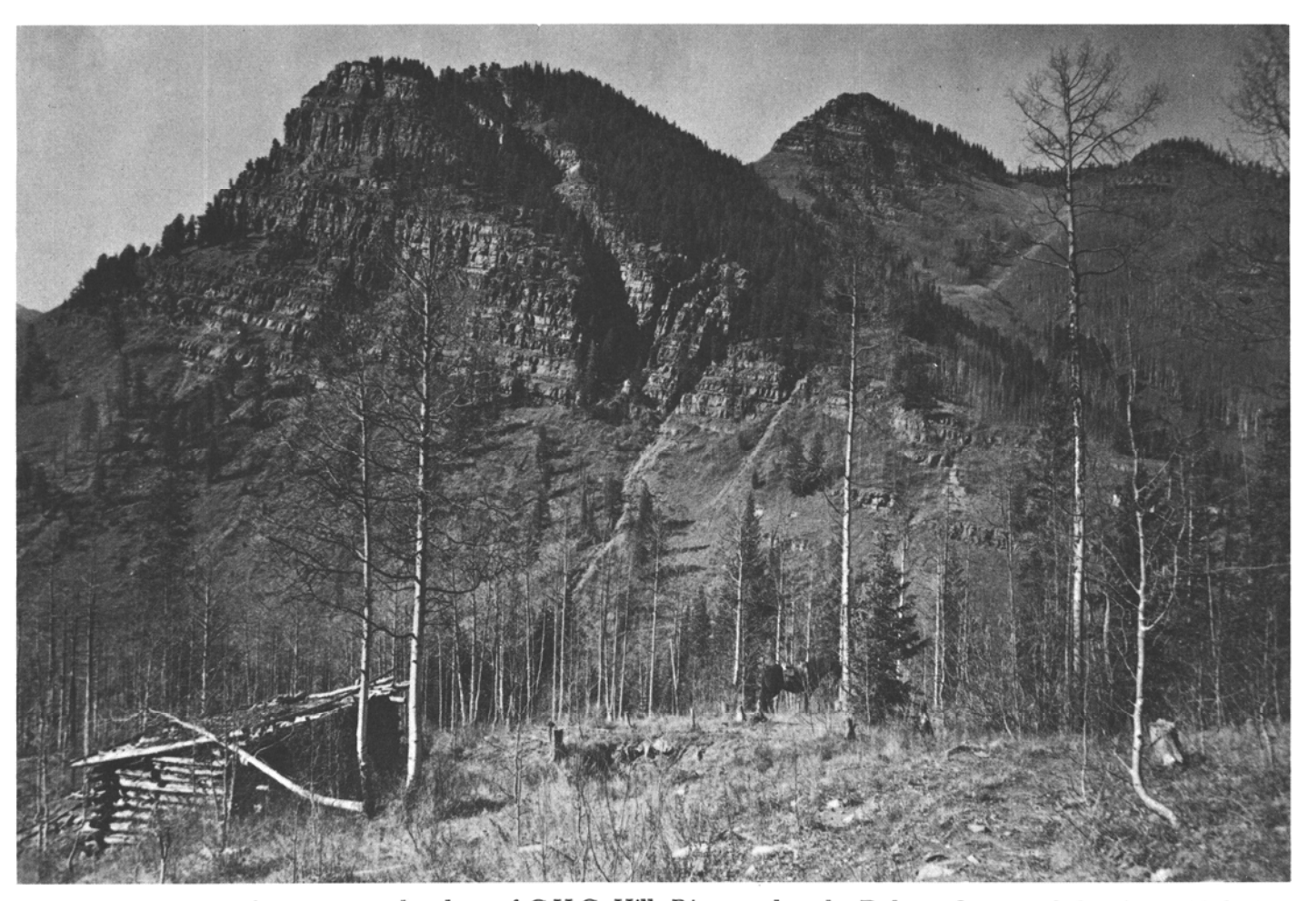
Sandstone Mountain, from near road at base of C.H.C. Hill, Rico quadrangle, Dolores County, Colorado. Published as figure 2 in U.S. Geological Survey Geologic Atlas, Folio 130, 1905.