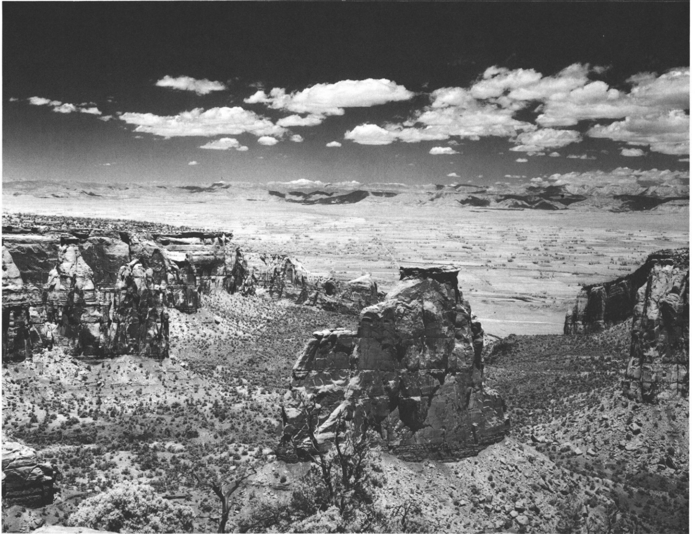
Independence Monument, separating the two entrances of Monument Canyon in Colorado National Monument. Looking north from Grand View; Colorado River, Grand Valley, and Book Cliffs in distance. Roan Cliffs are white cliffs at extreme distance on right skyline. Floor of canyon is Proterozoic metamorphic rocks; overlying strata are upper Triassic. Slopes at foot of cliffs are red Chinle Formation; cliffs are Wingate Sandstone (107 m); thin protective caprock on top of cliffs is lower sandstone of the resistant Kayenta Formation. Top of monument is nearly 137 m above canyon floor.