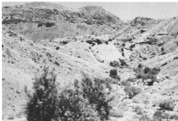
Figure 1. View north (toward Socorro Peak) along the arroyo leading to the fossil locality in the light-colored strata near the center of the photograph.

The age of the Socorro flora is conservatively bracketed between the 26.7 m.y. old South Canyon Tuff and the oldest (11.9 m.y.) flows of the Socorro Peak Rhyolite, and is possibly younger than the 20.5 my. old rhyolites of Water Canyon Mesa (C. E. Chapin, 1983, oral commun.). The occurrence of the flora in a facies contemporaneous with the red mudflow facies of the Popotosa Formation suggests that it may represent a period between 20 and 15 m.y. (R. M. Chamberlin, 1983, written commun.). Thus, the Socorro flora is probably early or middle