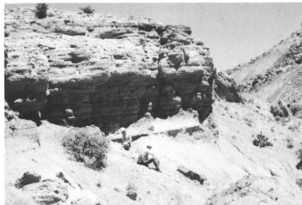
Figure 2. View of light-gray fossiliferous siltstone to mudstone strata of the lower Popotosa Formation at base at overhanging ledge of sandstones and conglomerates.