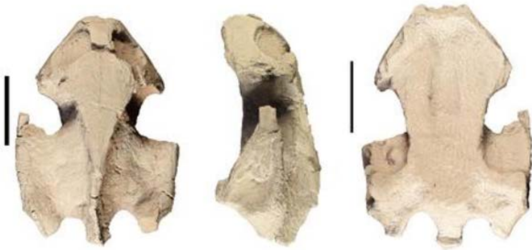
Referred specimen of Axistemys montinsana from the Nacimiento Formation in the San Juan Basin. Scale bar = 3 cm.

Axestemys montinsana is a trionychid turtle that was originally named and described from the Scarritt Quarry of the early Tiffanian interval of the Melville Formation in the Crazy Mountains Basin of Montana. We report the discovery of a skull attributable to this taxon from the Torrejonian interval of the Nacimiento Formation in Kutz Canyon, San Juan Basin, New Mexico. This identification of the first San Juan Basin record of Axestemys is based on comparison to the holotype skull, which compares closely with the New Mexican specimen. Thus, it is identified as an Axestemys based on its large (length) and triangular-shaped skull as well as the presence of a wide, smooth, unsculptured border of the carapacial callosity in an associated carapace fragment. The San Juan Basin and holotype specimens differ from other Axestemys in the extent of the parietals, with the frontal and postorbital broadly separating the parietals from the orbits. Furthermore, the anterior elongation of the cavum tympani in the New Mexican specimen is similar to the holotype of A. montinsana . This first New Mexican record of Axestemys montinsana extends the known range of A. montinsana south from Colorado, resulting in a range covering the Rocky Mountain region from Montana to New Mexico. It also fits with models of little or no provinciality of vertebrates in the western USA during the Paleocene.