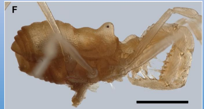
Harvestman from Terrero Cave 3 ( Sclerobunus jemez )