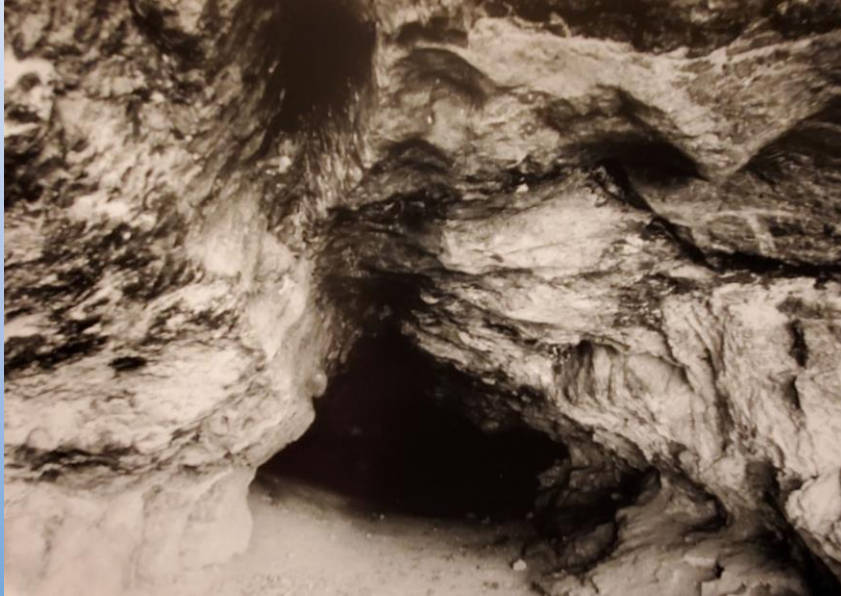
Main Cave Passageway, 1984