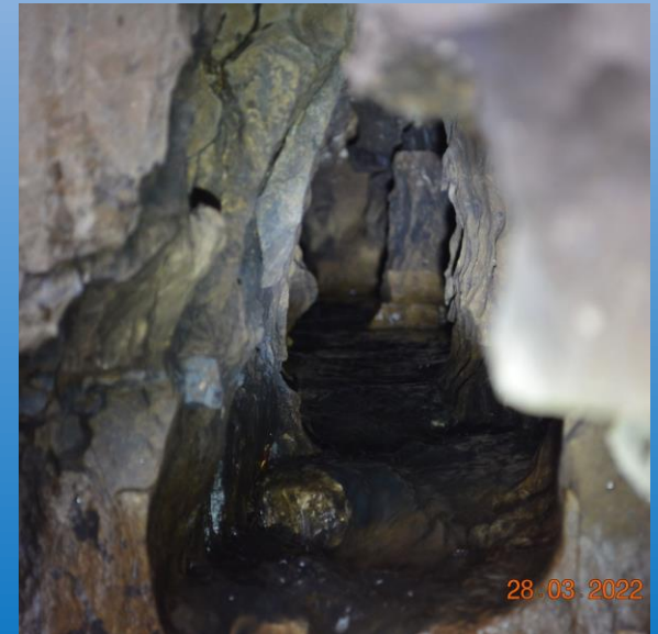
Water Inside Cave Tunnel