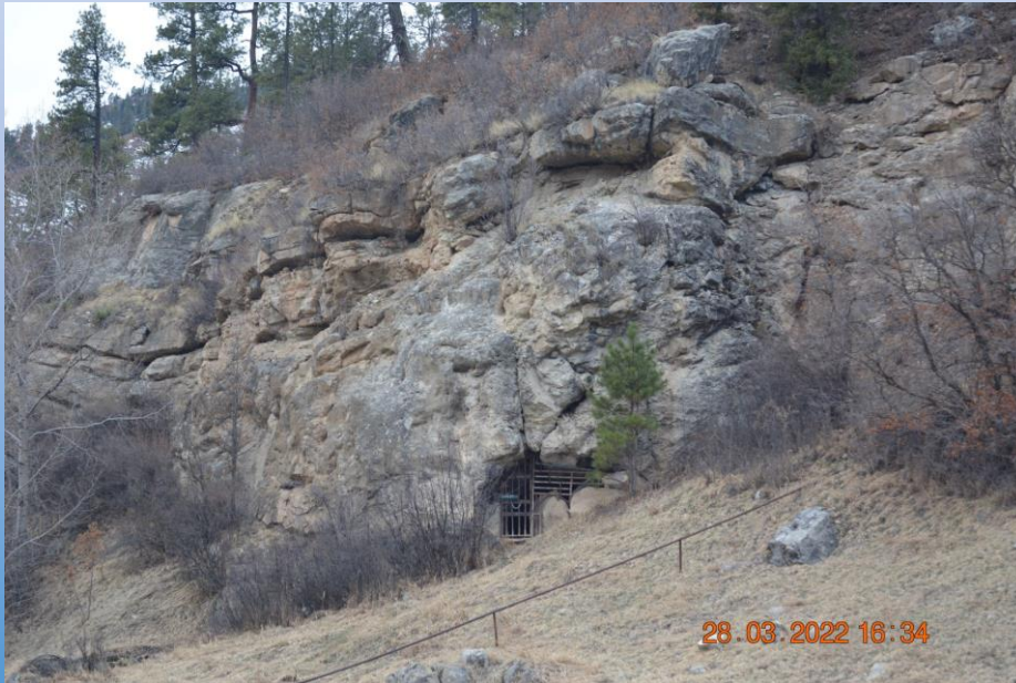
Gated Cave Entrance