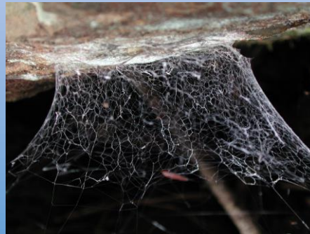
Lampshade Spider Web 2 ( Hypochilus web from Appalachia)