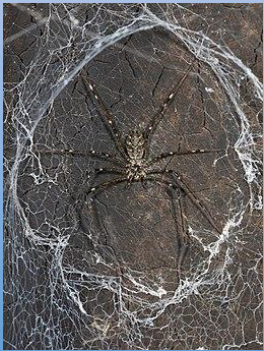
Lampshade Spider 1 ( Hypochilus from North Carolina)