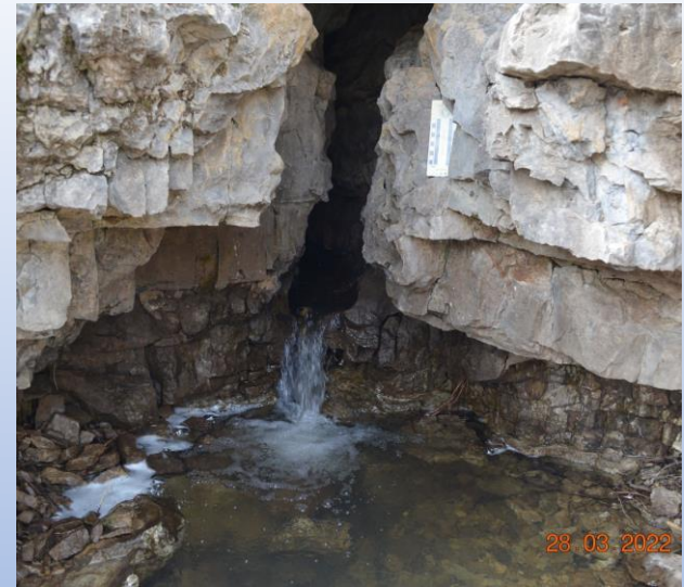
Water Flowing out of Cave Tunnel