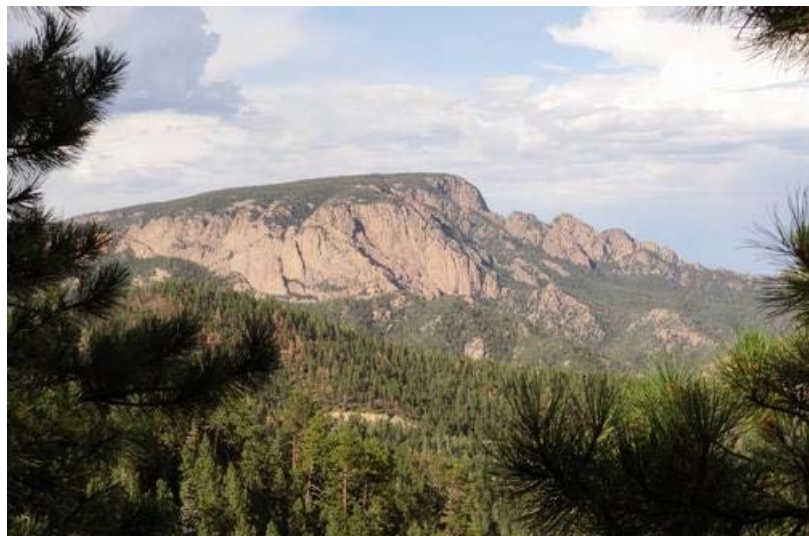
View of northwestern face of Hermit's Peak from Johnson Mesa.