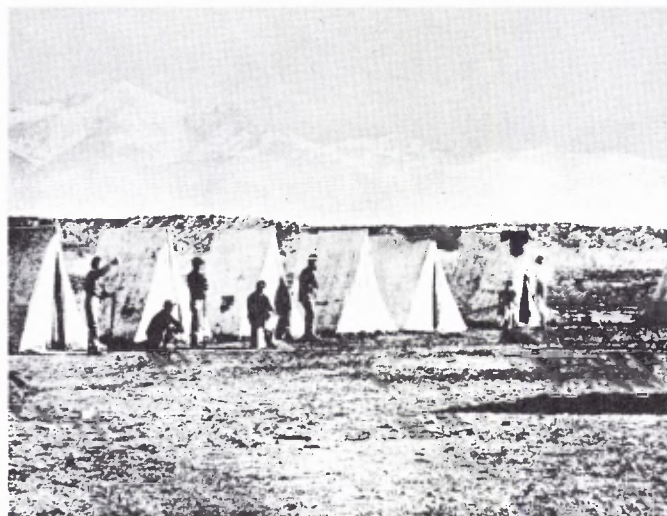
Company D, 15th Infantry camped at Fort Garland, Colorado Territory, March 11, 1872.

Lieutenant General William Tecumseh Sherman made an inspection trip to Fort Garland in 1866. While there he held a conference with Ouray, the chief of the Utes, and