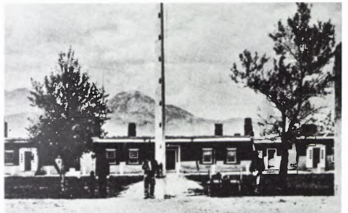
At one time the flagpole was on the south side of the parade ground, near the sally port. Vestibules can be seen on several doors.

The buildings were made of adobe, their interiors plastered with mud and whitewashed with lime. Roofs were of sod. There were board floors, and open fireplaces, with stoves for additional heat. Water was obtained from Ute Creek, by means of an acquia (Spanish for canal or