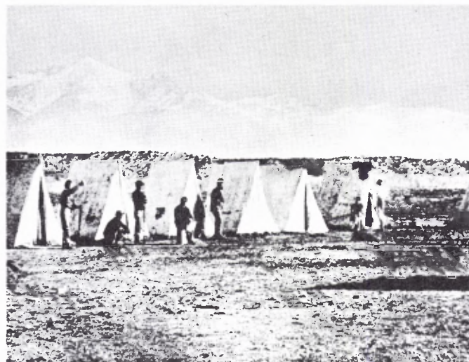
Company D, 15th Infantry camped at Fort Garland, Colorado Territory, March 11, 1872.

Lieutenant General William Tecumseh Sherman made an inspection trip to Fort Garland in 1866. While there he held a conference with Ouray, the chief of the Utes, and