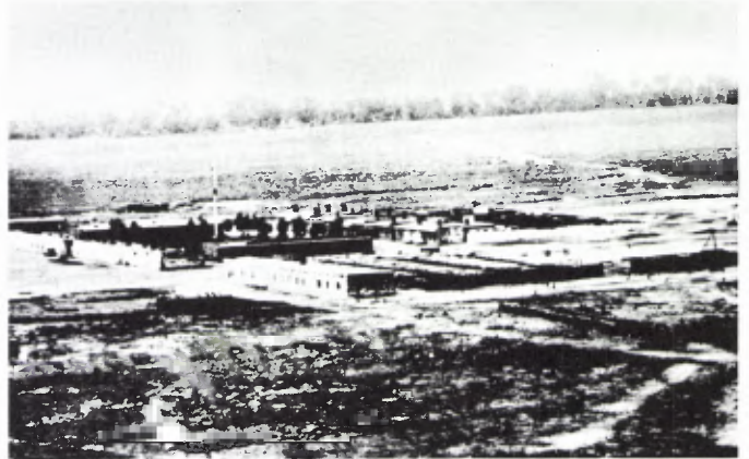
An early view of the fort looking northwest from the hill east of the fort. The commissary and stables, no longer existing, are in the foreground.

abandoned because it was found vulnerable to Indian attack, being so situated that hostiles could fire from the hills down into the fort.