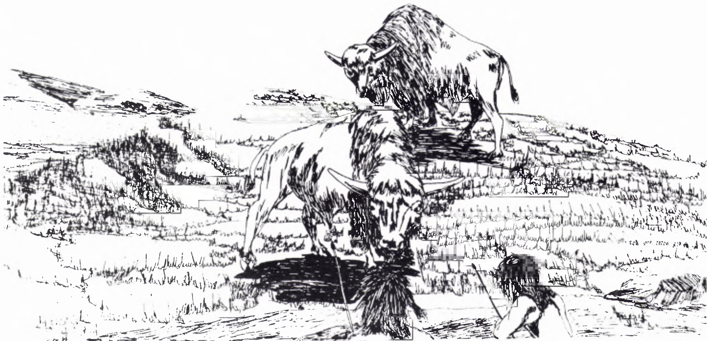
Figure 4. Paleo-hunters stalk Bison antiquus . (Drawing by Gale Egan)

effect was the thinness of the midsection of the point. If the finished or nearly finished point was too thick to suit the manufacturer, then a single flute or, more commonly, a flute from each face was removed. This has been demonstrated in an analysis of approximately one hundred Midland and Folsom points from the Blackwater Draw site. It would appear, then, desirable to revise the definition of Folsom points to include the unfluted Folsom type, rather than adding an additional, meaningless designation. This does not mean there are not unfluted Folsom sites, for several have been discovered; but it does mean the unfluted sites designated as Midland are simply Folsom sites where the points manufactured were thin enough so that fluting was unnecessary.