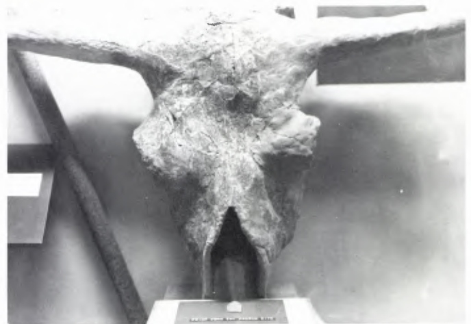
Figure 3. One of the straight-horned Bison antiquus , taken from the Folsom Type site in northern New Mexico along with one of the points from this site.

of a separate designation, such as Midland, for unfluted Folsom points does not appear to be warranted, and serves only to split an already valid type into unnecessary subdivisions. In the Folsom industry, at least, it can be said that the desired