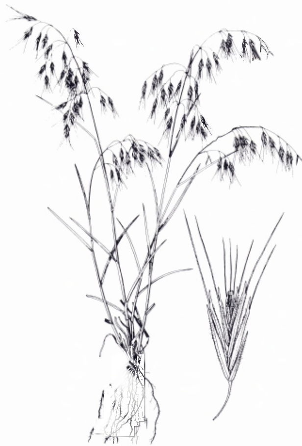
Downy brome plant and spikelet, Bromus tectorum .