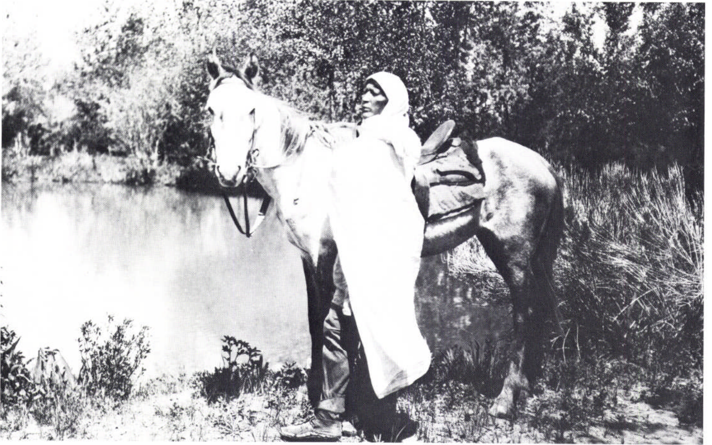
Man with horse (at what is now Kit Carson State Park), 1920's(?).