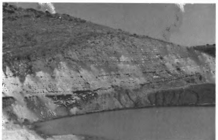
FIGURE S-2.4. Outcrop of the Glencairn Formation at mile 9.6.