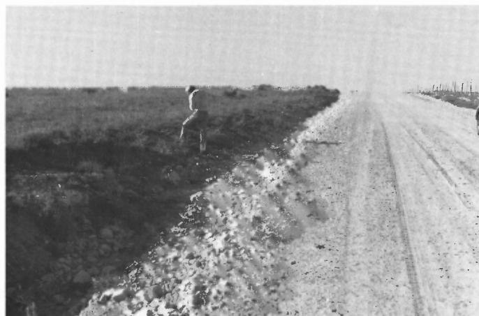
FIGURE S-2.1. Lincoln Member of Greenhorn Formation at mile 4.4.