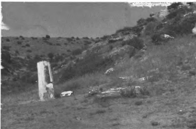
FIGURE S-2.3. The "petrified forest" at mile 6.8.