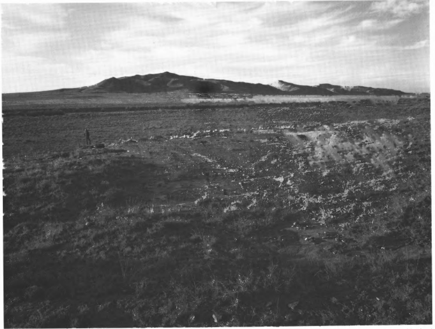
Valley of Ute Creek about 29 km east of Mosquero. View is N30°W up valley. Ute Creek (dark line in middle distance) flows in a wide sandy channel bordered by a low scarp underlain by Quaternary alluvium and Triassic shale. Salt cedar is abundant in places along the channel. Camera station is on bench underlain by crossbedded Triassic sandstone; man is standing at edge of bench. Partially stabilized eolian sand covers Triassic sandstone at left and right edge of photograph. Hills in distance are made up of Triassic and Jurassic sedimentary rocks capped by remnants of an upper Tertiary basalt flow. Camera station is in NW 1 / 4 sec. 15, T18N, R31E. Altitude about 1,356 m. 27 December 1986, 4:08 p.m., MST.