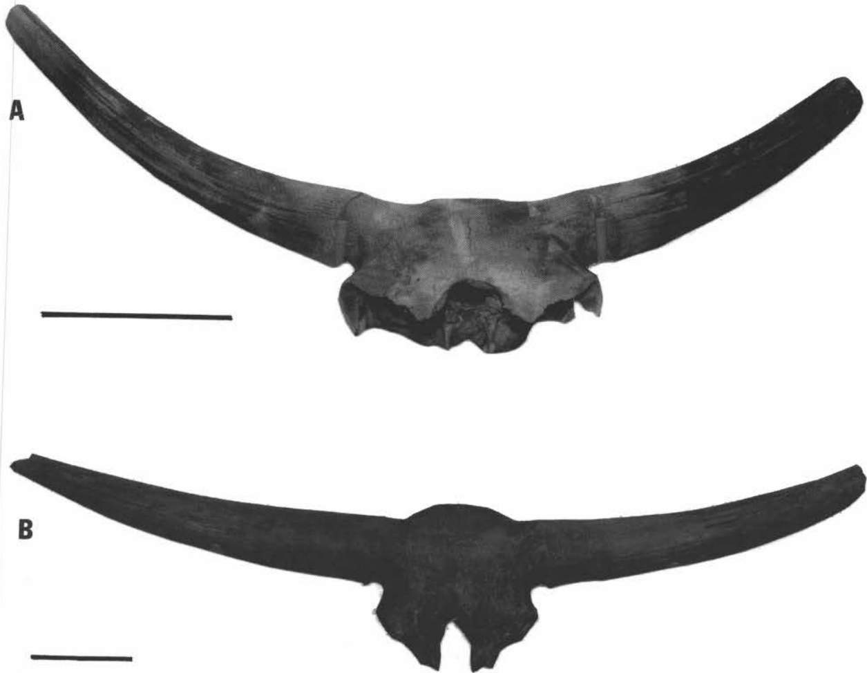
FIGURE 3. Bison latifrons skulls at Panhandle Plains Museum. A. WTSU unnumbered, female skull from Lake Meredith National Recreation Area, Potter County, Texas. B. PPHM 2315-1, male skull, Waters Ranch, Lipscomb County, Texas. Scale bars are 25 cm.

several more, depending on the details of Wilson's (1988) discoveries. The known paleontological potential of the region and the fact that several sites have been found within the study area, without any paleontological exploration, suggests a strong potential for finding significant fossils of this age in Lake Meredith National Recreation Area and Alibates Flint Quarries National Monument.